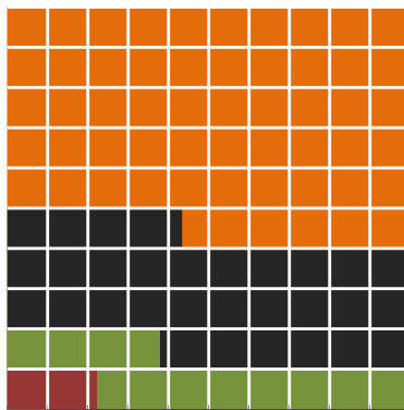
One square = 1% n = 2,573,320