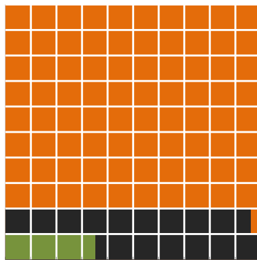
One square = 1% n = 422,138