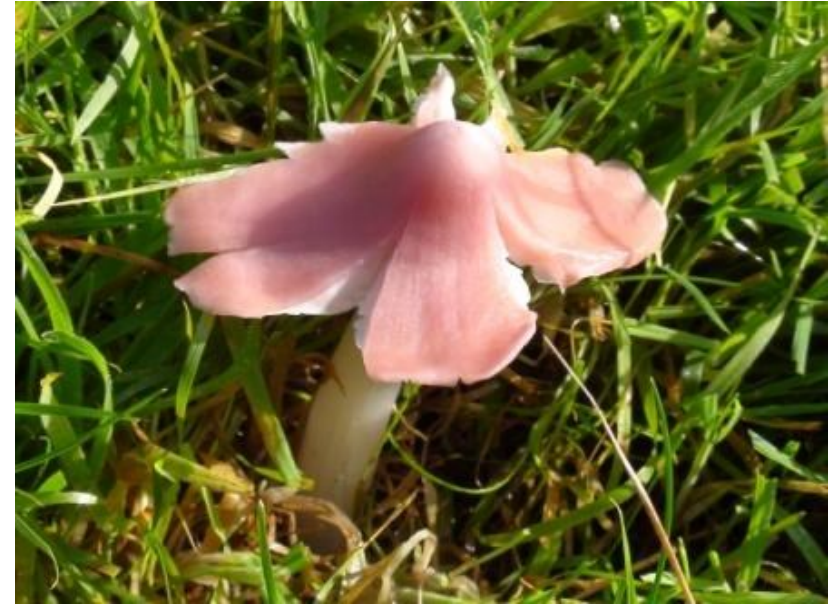
Porpolomopsis calyptriformis.

If you require a certificate of attendance for CPD purposes, please email biorec@mmu.ac.uk before you attend the course.