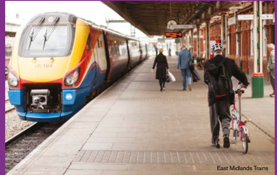
East Midlands Trains