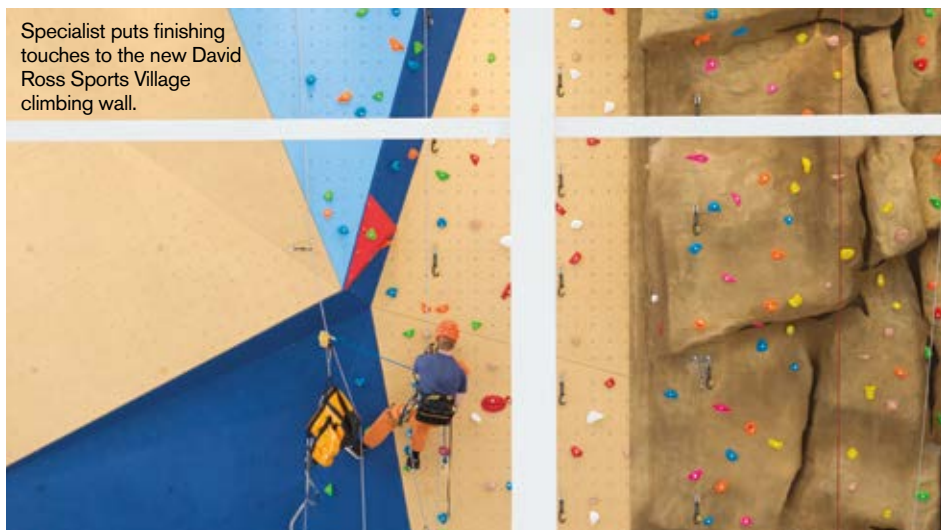
Specialist puts finishing touches to the new David Ross Sports Village climbing wall.