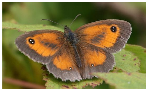
Photograph: Gatekeeper butterfly