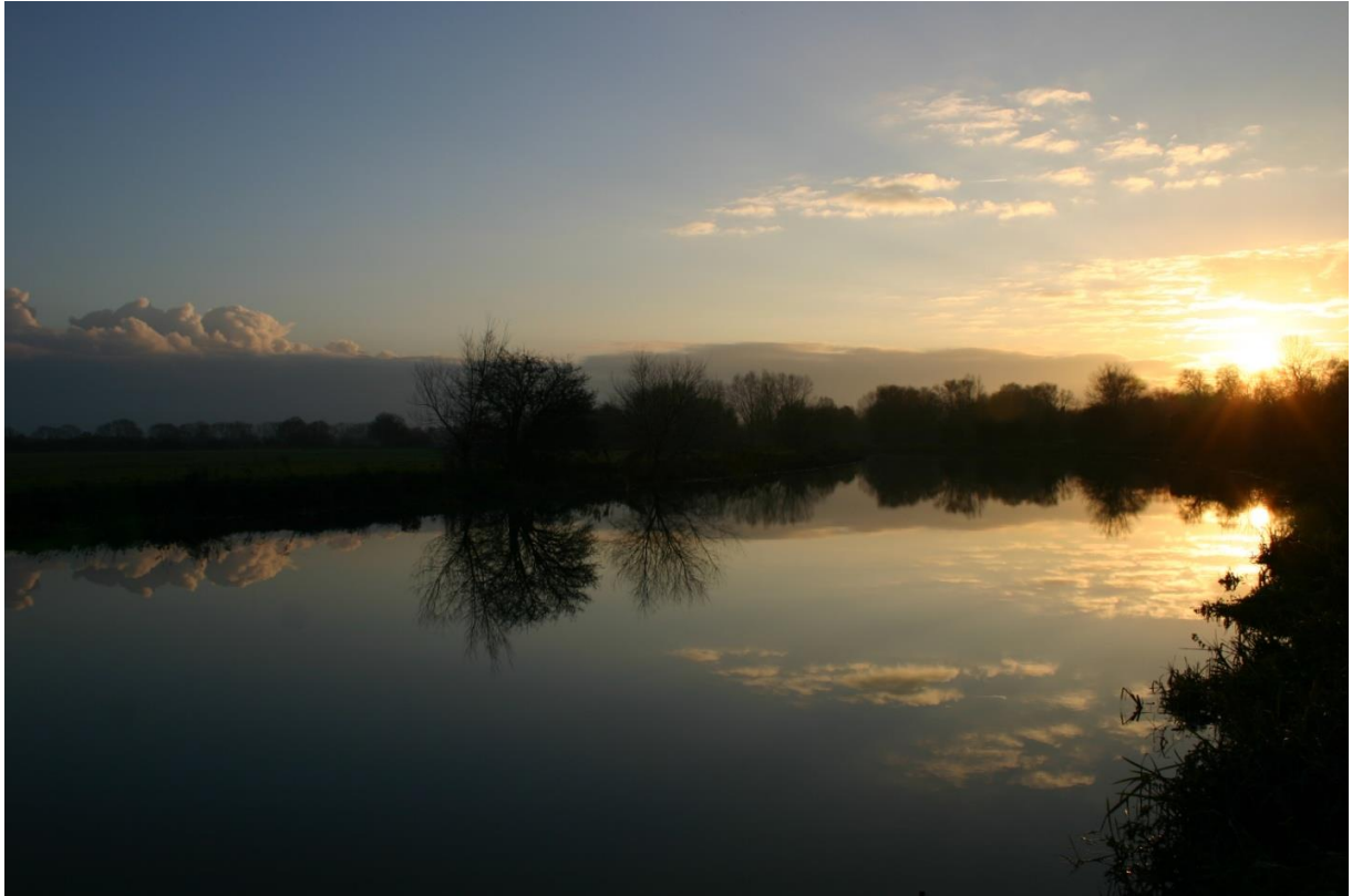
Photograph: a typical view of the river near River Lane