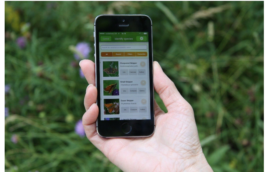
NERC - Centre for Ecology & Hydrology

This is part of the programme of professional development courses run by the School of Science and the Environment.