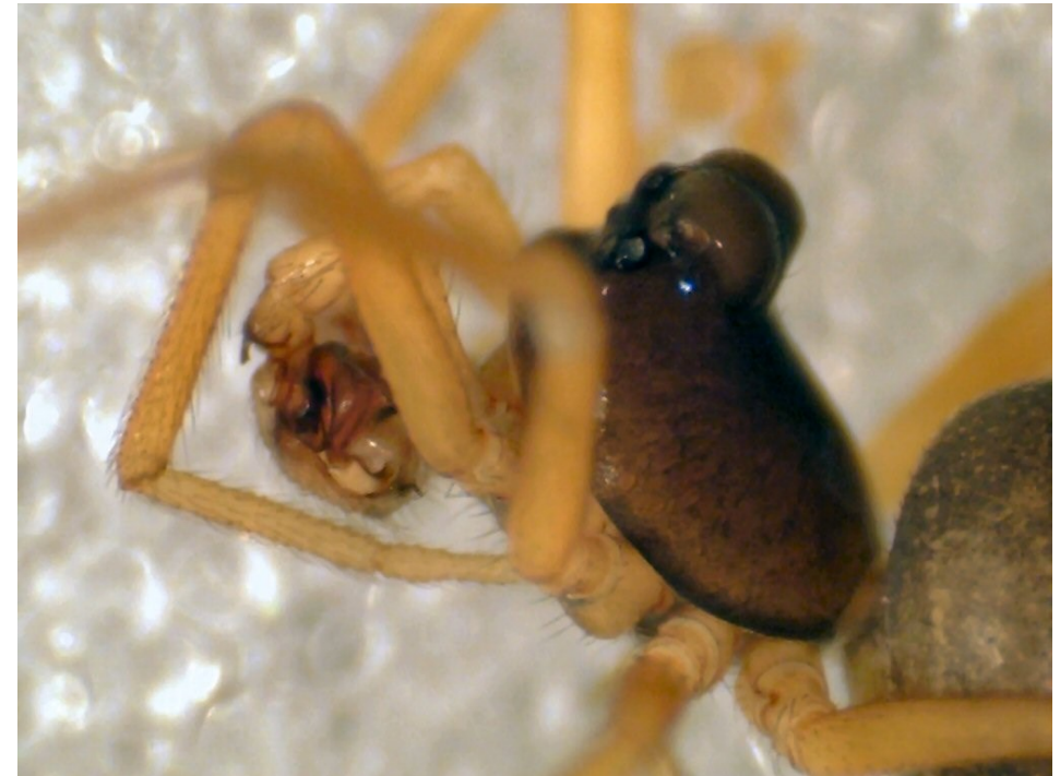
Male Dismodicus bifrons

This is part of the programme of professional development courses run by the School of Science and the Environment.